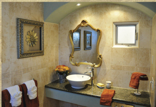
Our popular casitas offer a little more privacy and luxury to our guests with amenities like spacious bathrooms, balconies and fireplaces.