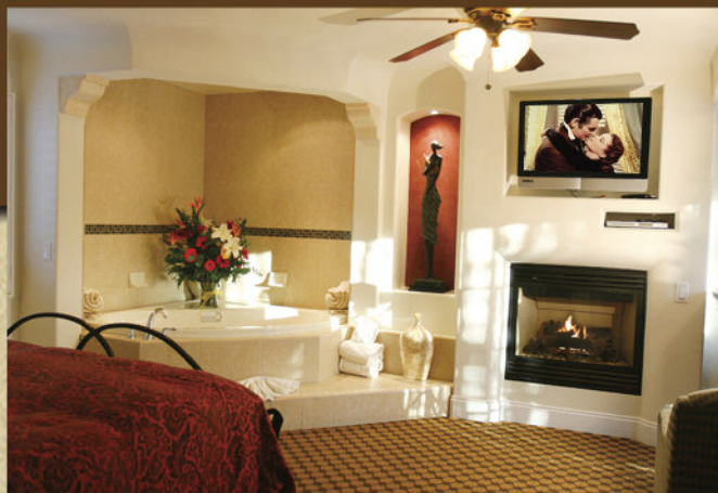
Eagle Inn rooms are spacious, and many of our rooms and casitas feature fireplaces and whirlpool tubs.