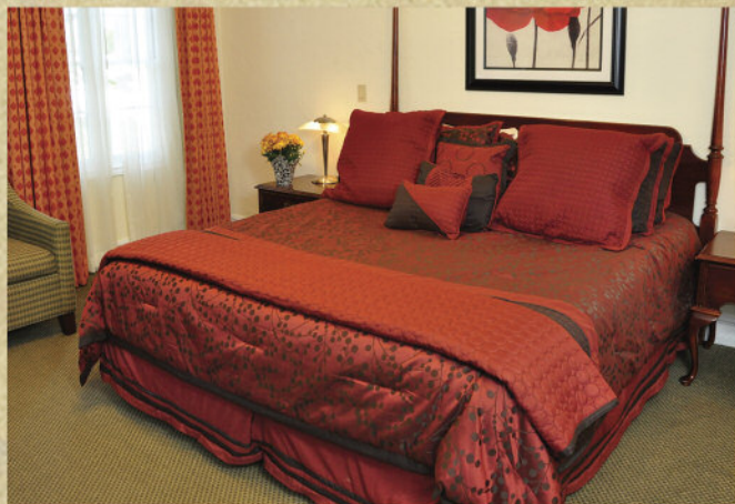
Even our basic rooms have free Internet, comfortable beds, handsome bathrooms, work stations, a TV and a DVD player.